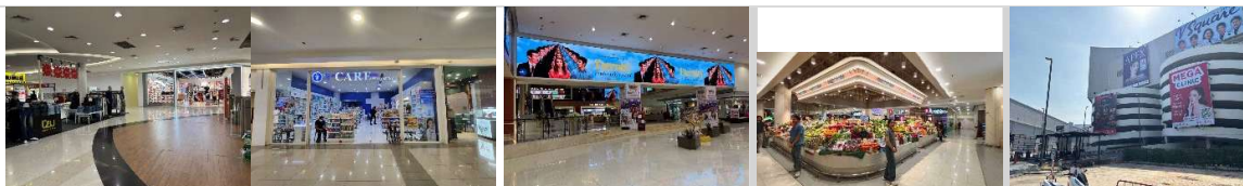
Retail space, Signage space, and Common area for rent

The Property is leasehold right of a part of shopping mall and common area with a total area of 105,613.26 square meters of Future Park Rangsit Located at No. 94 Phahonyothin Road, Prachathipat Subdistrict, Thanyaburi District, Pathum Thani Province.